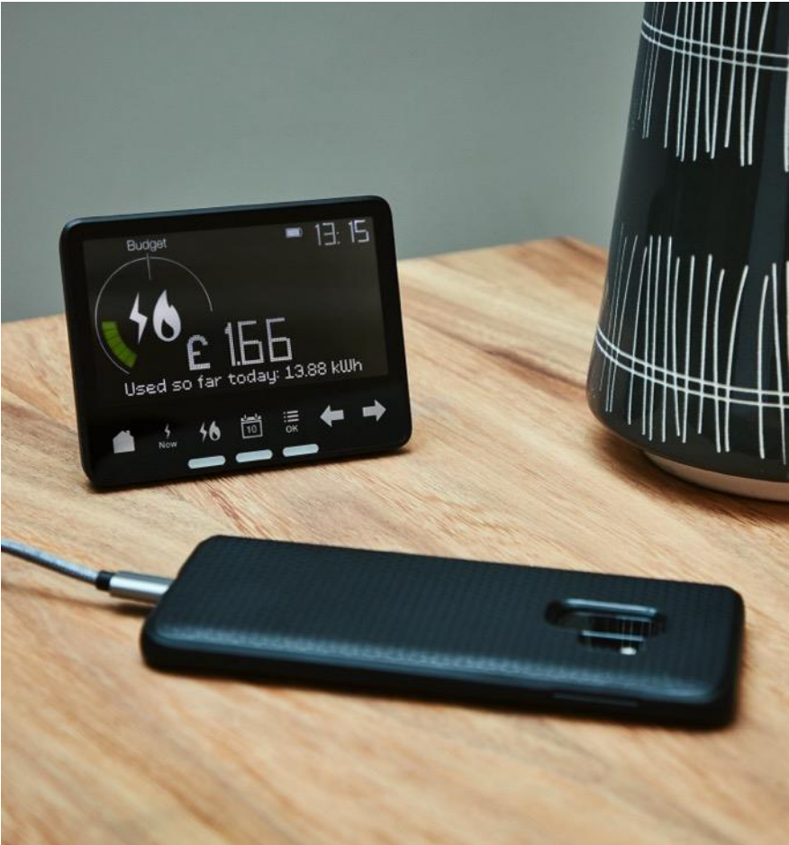
Smart Energy GB